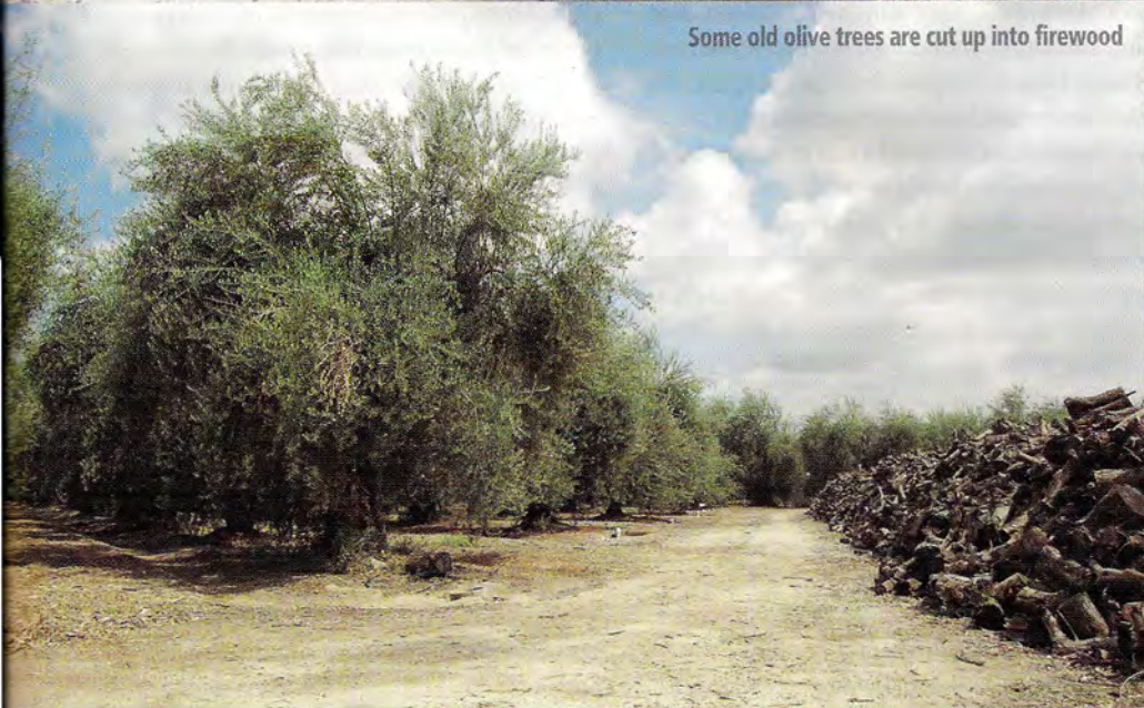
Some old olive trees are cut up into firewood