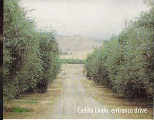
Cielito Lindo entrance drive