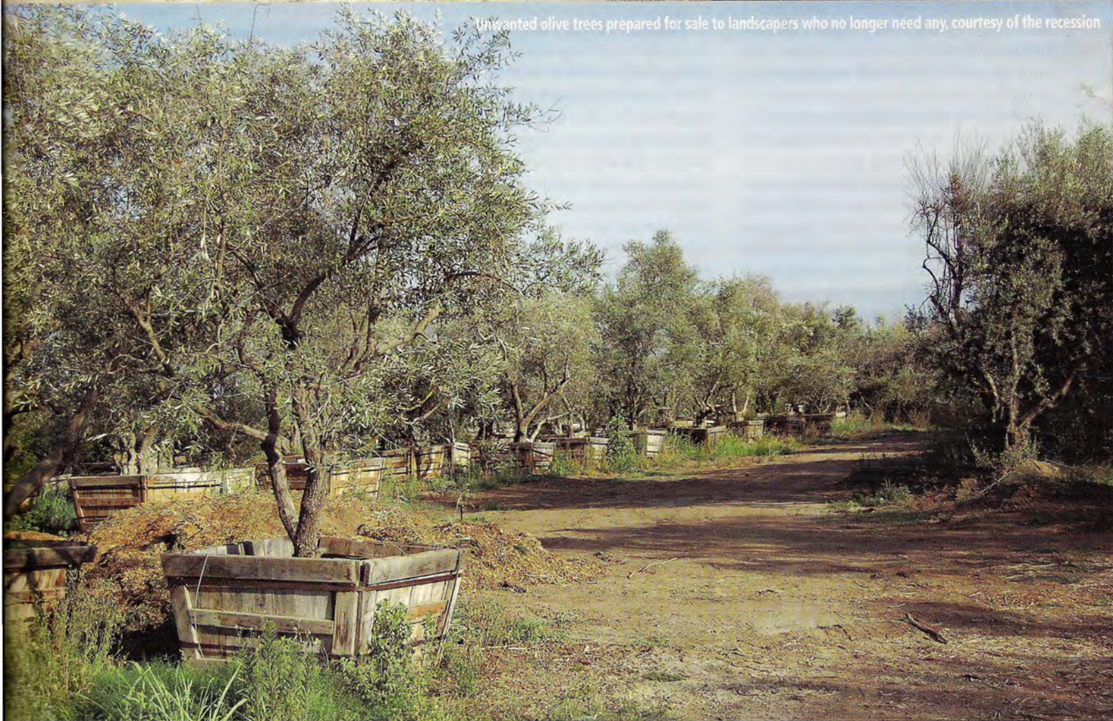
Unwanted olive trees prepared for sale to landscapers who no longer need any, courtesy of the recession